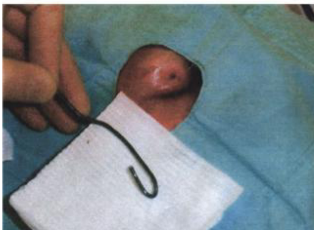
Figure 3 The wire completely removed from the eyelid.

caliber or injuries which penetrated in the opposite direction to normal.