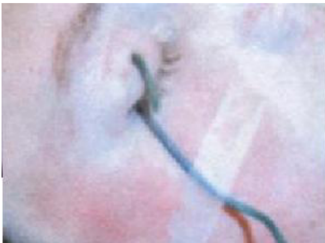
Figure 1 Patient eye on arrival.

1% Lignocaine was infiltrated in to the upper lid, the lid averted, and the wire passed out through the defect, (fig-