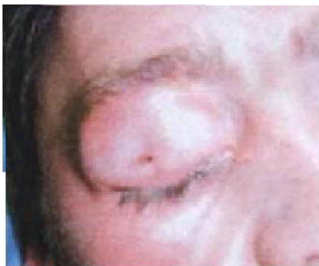
Figure 4 Patients eye after complete removal of the wire.

Moreover, topical anesthesia has been shown to be safe and effective [6] especially in this case where the patient