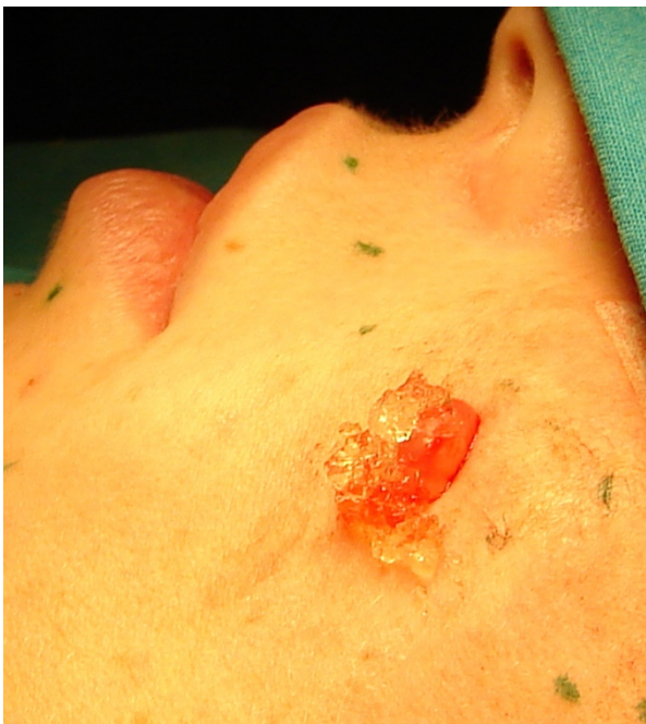
Figure 2 The cystic lesion filled with a gelatinous material was removed.

The cyst in the zygomatic region is the element of a seemingly obvious relationship: its formation was attrib-