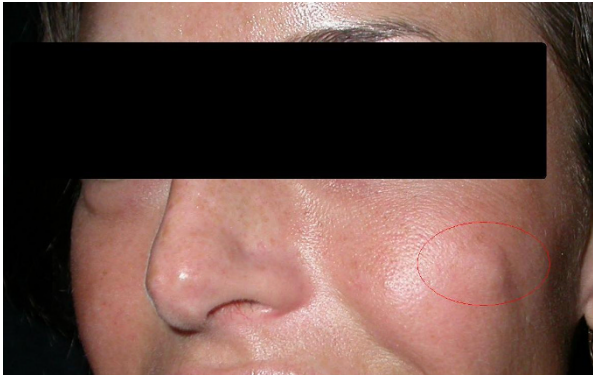
Figure 1 Preoperative appearance of the neoplastic nodule.

ondary to injection of hyaluronic acid skin fillers is believed to be low, and the vast majority of them represent a foreign body-related chronic inflammatory reaction.